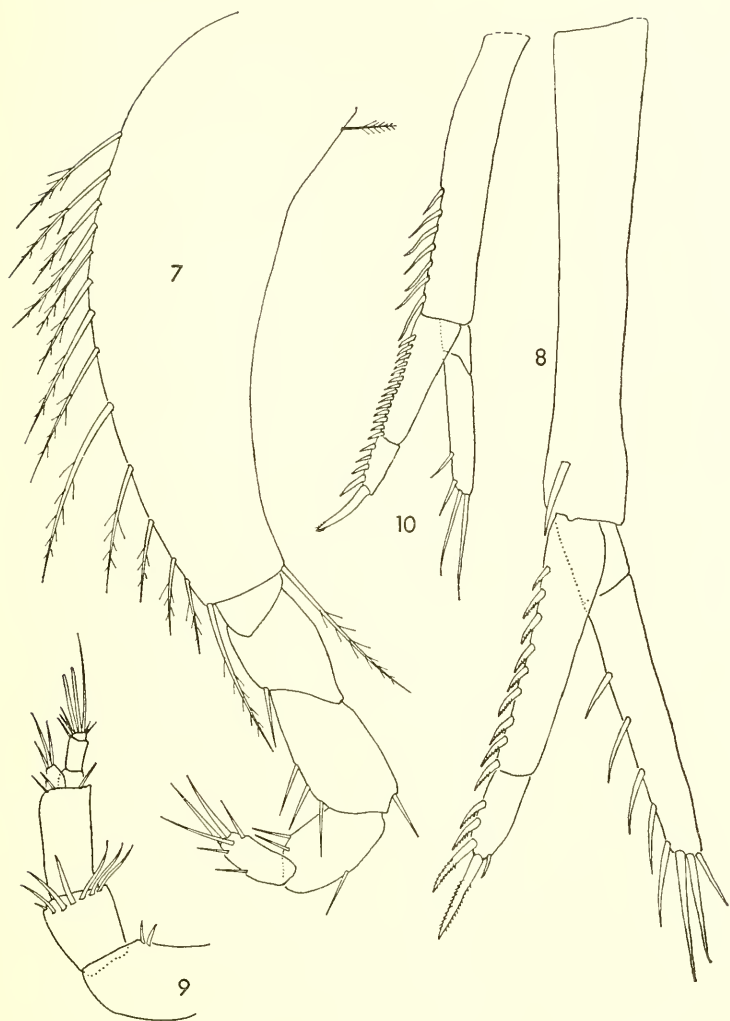
FIGS. 7-10. Spilocuma salomani , new species: 7, Pereopod 1, female; 8, Uropod, female; 9, Antenna 1, male; 10, Uropod, male.

new genus. Pseudoleptocuma is quite similar to Mancocuma but differs from it in the number and development of the pleopods in the male, in the development of the male second antenna flagellum, and in the elongate form of the pereopod 1 propodus.